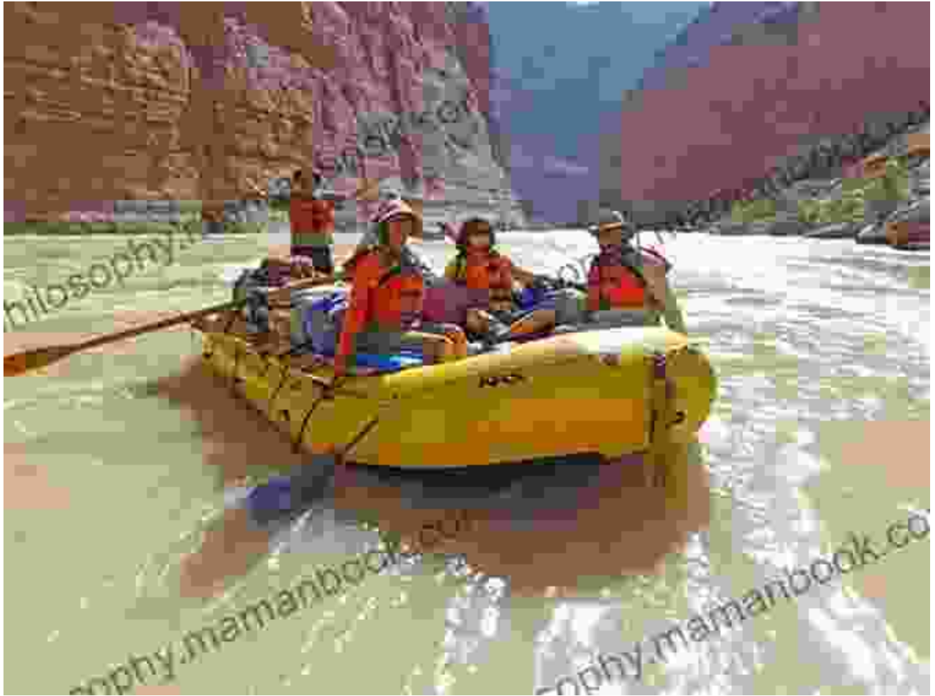
Rafting in the Grand Canyon.