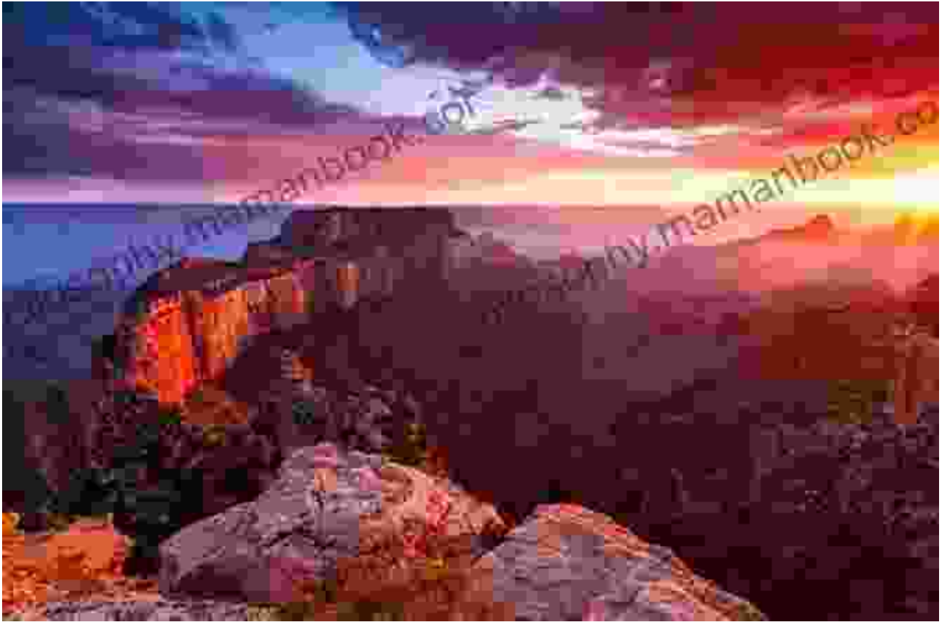
A sunset over the Grand Canyon.