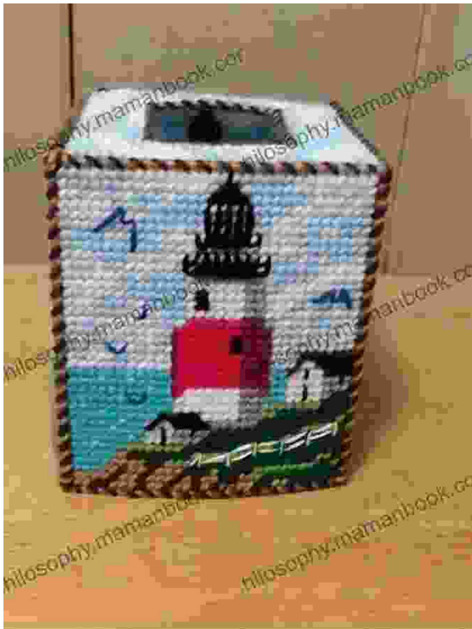
Lighthouse Boutique Tissue Box: Plastic Canvas Pattern by Dancing Dolphin Patterns