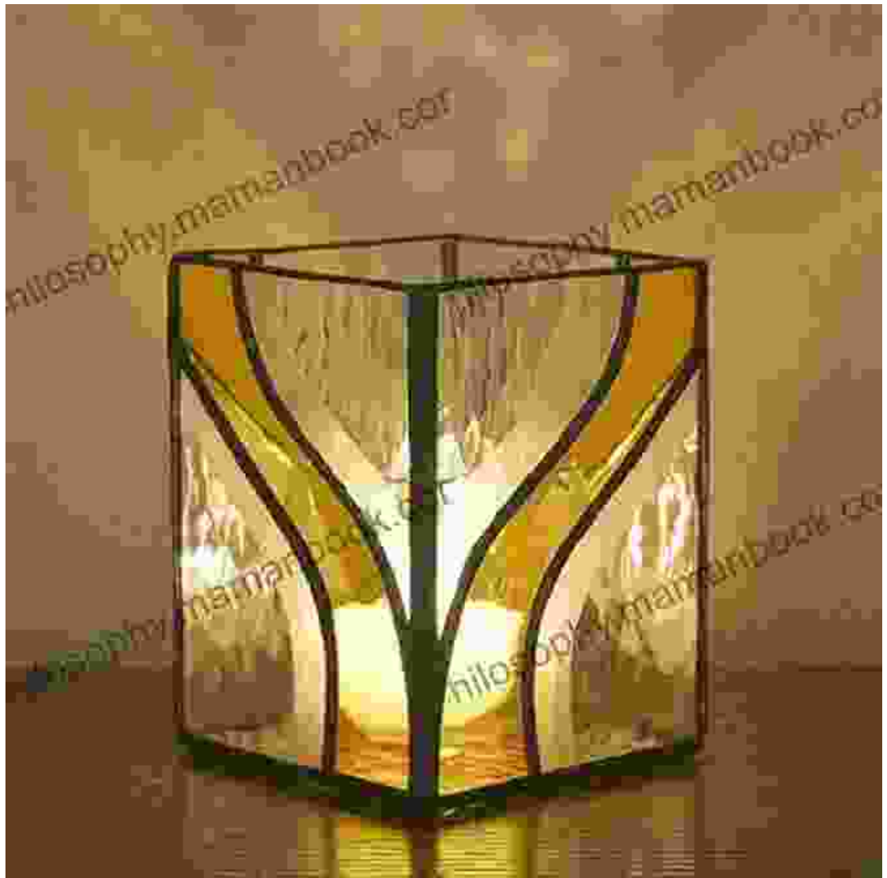
An Homage to Darkness and Beauty

realms. The collection includes intricate candle holders, each casting a flickering glow that dances on the walls. Stained glass windows, meticulously crafted with vibrant hues, bathe the room in an ethereal light. And the mirrors, with their ornate frames and antiqued glass, reflect an enigmatic beauty that draws you into their depths.