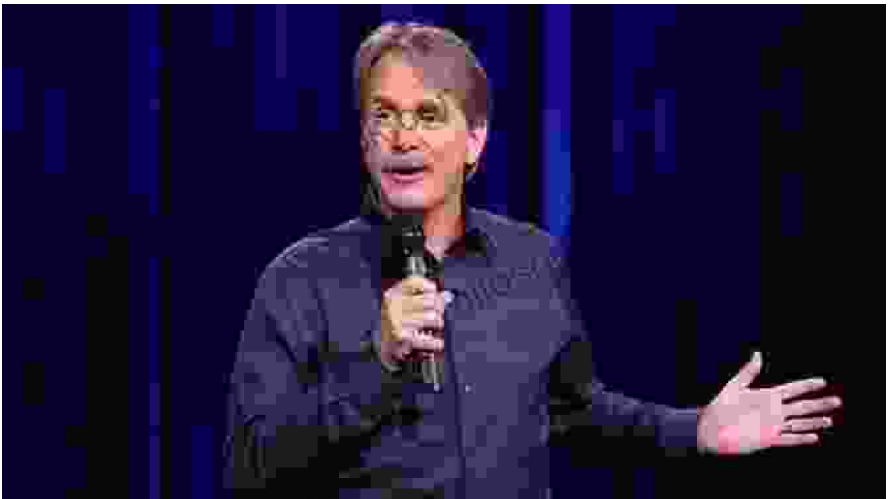
Jeff Foxworthy on stage